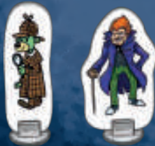
2 standees (Spy Guy & Doctor Moritz)