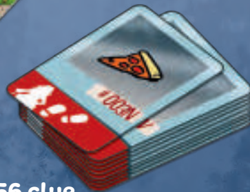
56 clue cards