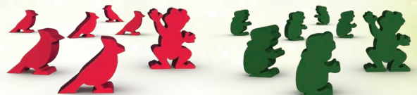
12 CRITTERS (6 CARDINALS, 6 TOADS) AND 2 FROG AMBASSADORS*