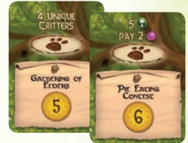
9 SPECIAL EVENT CARDS