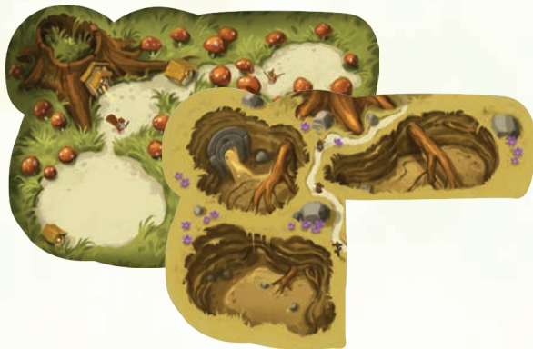
6 PLAYER BOARDS