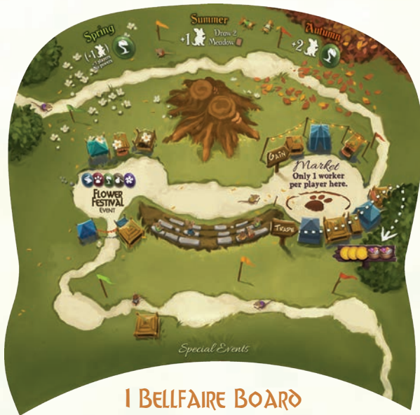
1 BELFAIRE BOARD