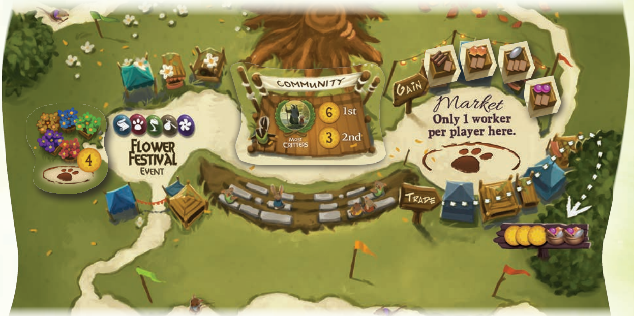
Bellfaire board set up to play with the Flower Festival, Garland Awards, and Market modules.

The Bellfaire board contains the Market location, and spaces for the Flower Festival Event and Garland Award tiles.