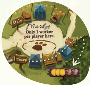
1 MARKET BOARD