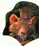
1 RUGWORT TOKEN