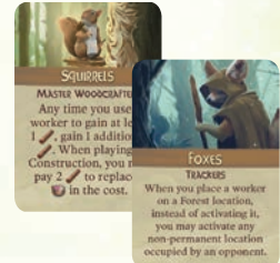
15 PLAYER POWER CARDS