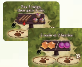
4 FOREST CARDS