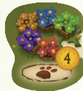
1 FLOWER FESTIVAL EVENT TILE