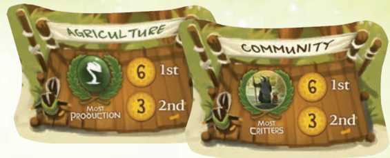
7 GARLAND AWARD TILES