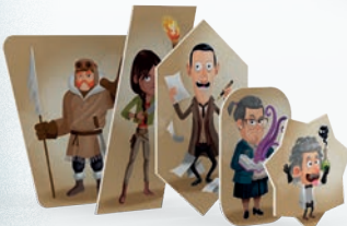
5 Investigator tokens