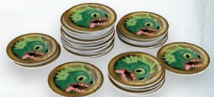
30 Deep One tokens