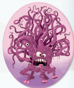
Offspring of Shub-Niggurath