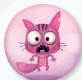
Cats of Ulthar