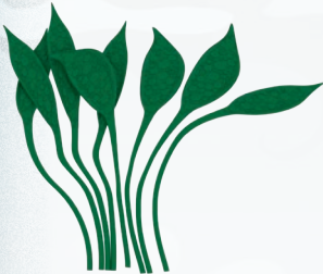
8 sticky tentacles