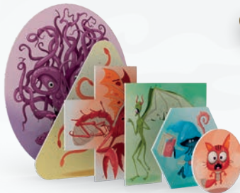
30 Creature tokens (6 x 5 different colors)