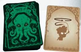
12 Curse cards